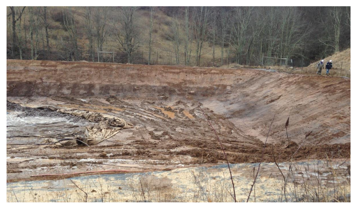
Empty waste pit showing discolored soil in West Virginia.

Numerous oil and gas companies, as well as entrepreneurial "start-ups," have invested in the development of technologies to solve these problems, but the costs and complexities of wastewater recycling systems—especially ones that can fit diverse geologies and water chemistries—have also been prohibitive.<sup>261</sup> Currently, the prospects for recycling appear limited, while more information from operators and regulators would be needed to determine what and how reuse is being applied and where the final waste products ultimately end up.