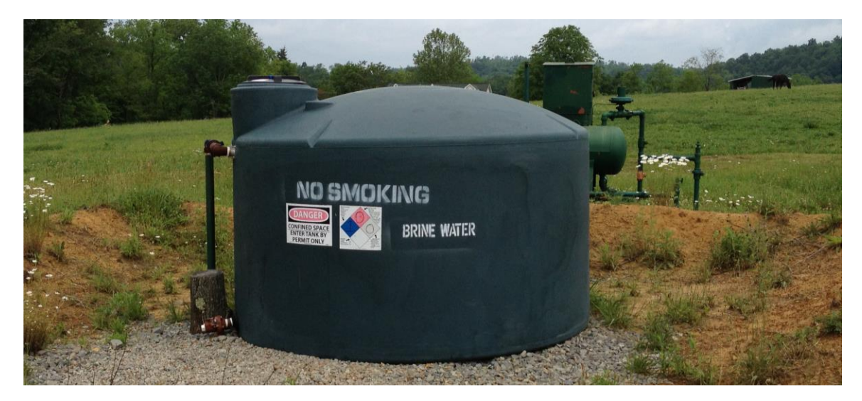
Brine storage tank.

This broad term refers to water resulting from oil and gas drilling and production that has a high saline content. Regulators generally use "brine" to mean produced water, but the term can also encompass flowback—especially because as produced water flows to the surface it mixes with the fluids and chemicals used in hydraulic fracturing.