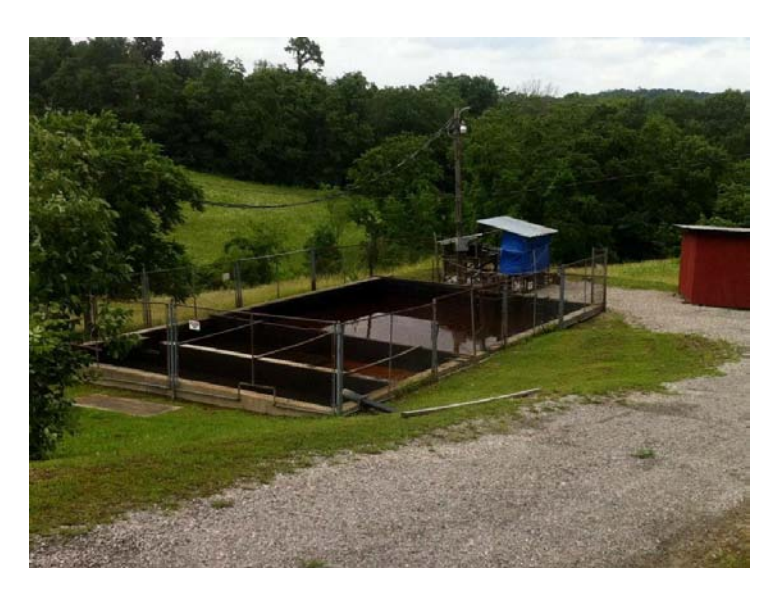
Storage pit at the Ginsburg injection well, Ohio.

In 2013, environmental and citizen's organizations and residents in Ohio wrote to the Region 5 Administrator of EPA