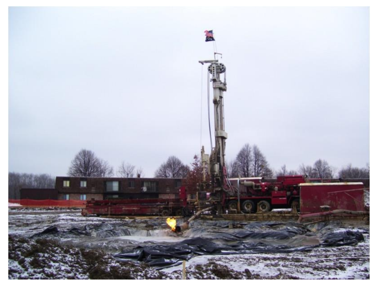
Ohio drilling site, with flame near a pit. it.

In sum, ODNR holds authority over any management of oil and gas field waste that is generated, stored, or processed onsite (i.e., at well sites), as well as disposal and the "beneficial use" of brine and the processing of solid waste landfills and transfer facilities. ODNR has also managed and regulated the state's Underground Injection Control (UIC) program since 1982, when the agency received approval to do so from EPA, a status known as primacy.<sup>279</sup>