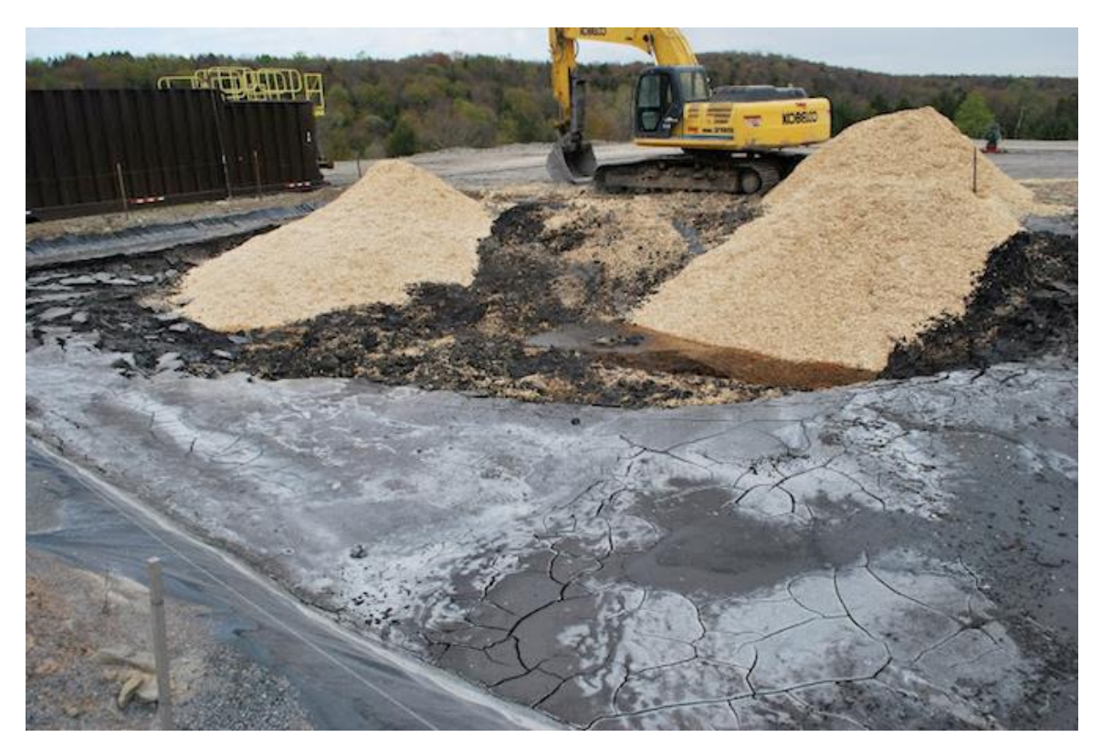
Sludge being blended with wood chips.

When it comes time for disposal, oil and gas field waste can blur the line between "solid" and "liquid." Certain wastes might fit the general definition of solid, including drill cuttings, muds, and fracturing sand—but when loads are brought to the surface after drilling, they contain fluids and formation water and form sludges. Produced water, flowback, and fracturing fluids are primarily disposed of at industrial or municipal wastewater treatment plants, but can also end up in landfills designed for solid waste. For example, between 2012 and 2014, operators in Pennsylvania reported sending over 260,000 barrels of "drilling fluid waste," "fracing fluid waste," "produced fluid," and "servicing fluid" to landfills.<sup>162</sup>