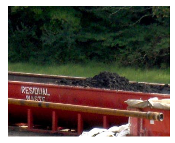
Drill cuttings at a gas well site in West Virginia.

The sheer volume, weight, and bulkiness of drill cuttings make their treatment and disposal challenging. Regulatory agencies generally consider drill cuttings to be simply rock and dirt, i.e., a natural material that can be disposed of in landfills. However, cuttings are coated with drilling fluids, and loads can contain a certain amount of liquid made up of the same chemicals used in hydraulic fracturing. Because they are essentially ground up bits of shale formations, they also contain radioactive material, salts, and hydrocarbons.