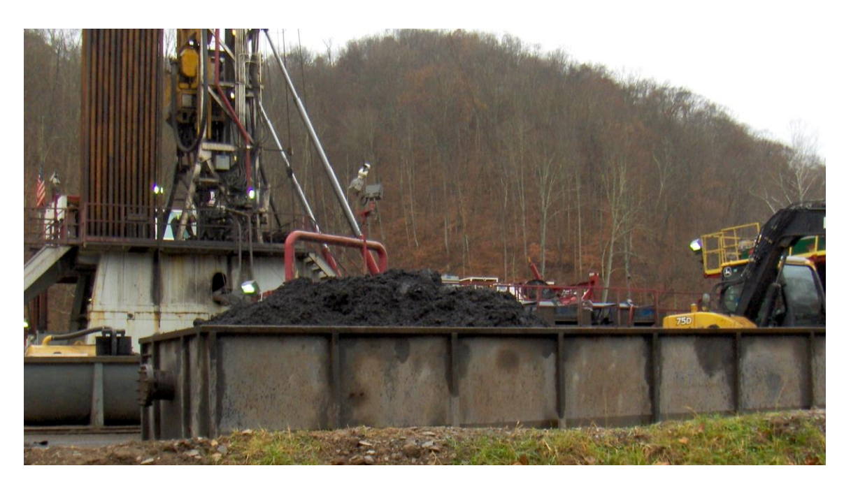
Drill cuttings stored at a well site in West Virginia.

To improve states' regulatory and enforcement programs going forward, the IOGCC assisted EPA in realizing a state regulatory review process. In 1989, it created the Council on Regulatory Needs, which brought together state, environmental, and industry representatives to develop national guidelines for state oil and gas programs. In early 1990, the Council released a report titled EPA/IOCC Study of State Regulation of Oil and Gas Exploration and Production Waste , which established guidelines for the integration of recommended criteria into regulatory programs. The Council also proposed to implement a process by which state oil and gas programs were reviewed in comparison with those guidelines.<sup>64</sup>