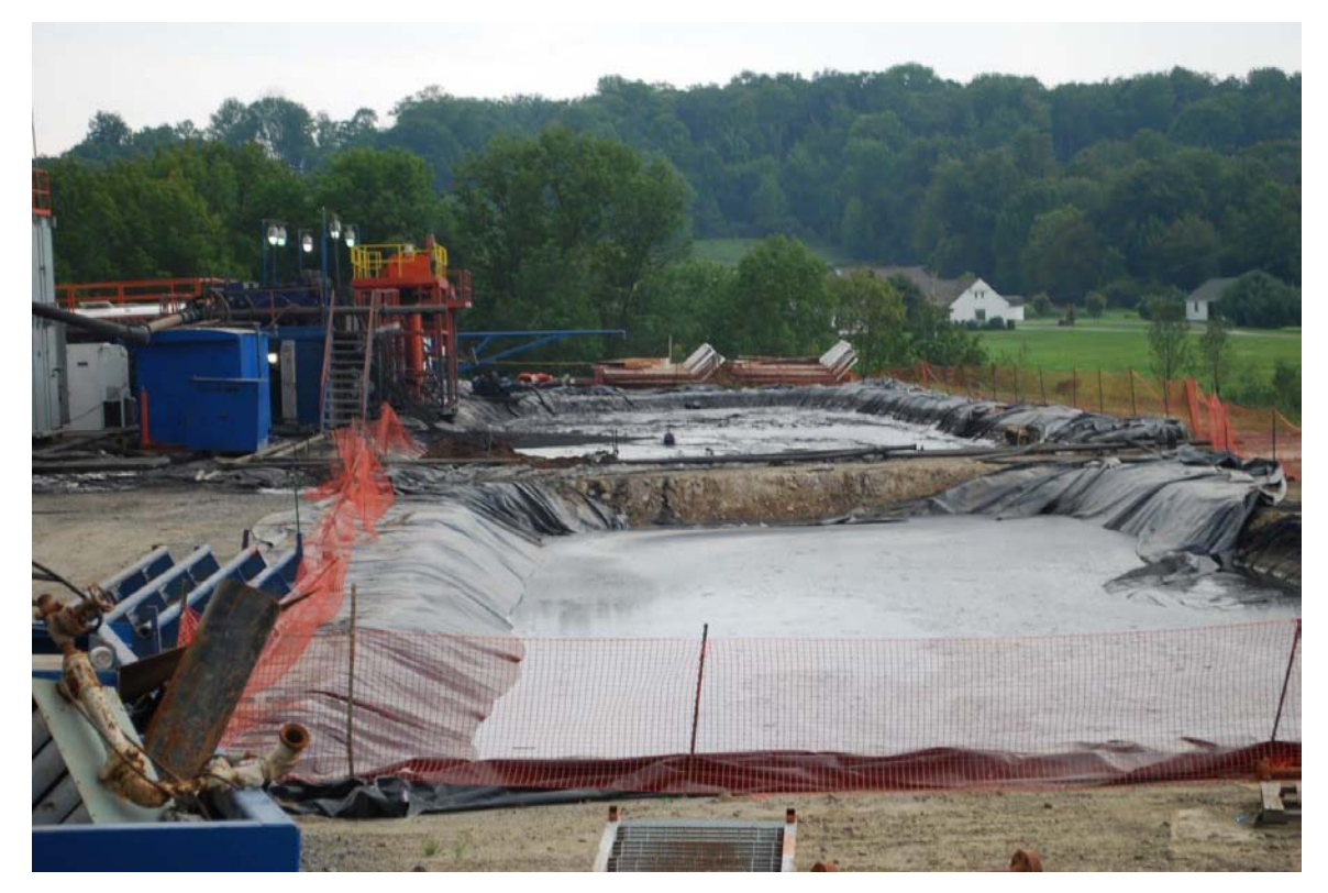
Waste pits under construction in Pennsylvania.

All Pennsylvania landfills have had radiation detectors in place since 2002, a response to concerns over improper disposal of medical waste. However, they are generally set to detect radiation coming off the waste at levels that would be hazardous for people nearby who are directly exposed. This can mean that significant volumes of waste "pass the test" for disposal but could still contaminate water and soil, especially over time. For example, in 2012, only 4% of the waste setting off radiation alarms at Pennsylvania landfills was considered too "hot" to handle and had to be shipped out of state to specialized facilities.<sup>141</sup>