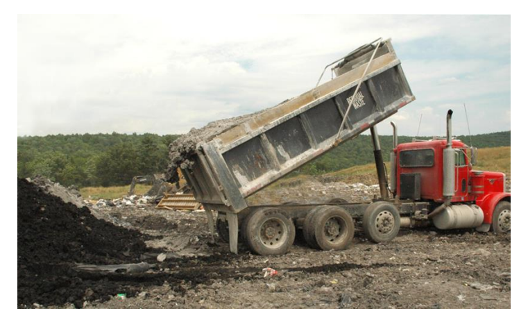
Drilling waste being dumped at a landfill in Pennsylvania.

by Earthworks and partner organizations found no evidence that PADEP inspectors ensure that they are followed, such as by being present during the process (e.g., to ensure that liners don't tear and waste isn't placed closer to streams or water wells than regulations allow).<sup>87</sup> PADEP has also confirmed that it doesn't always require operators to perform chemical analysis of waste prior to burial, despite regulatory limits on the chemical content of the leachate coming from pits.88