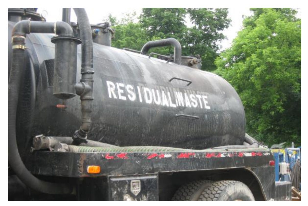
Waste truck at a drilling site in Pennsylvania.

Waste characterization forms are used by generators of waste in all the states considered in this report. In general, they allow for basic descriptions and operator latitude in whether or not to submit actual laboratory analysis of the content of the waste. In addition, operators are not required to provide sampling data for waste from every well or well site, but may be approved to cover many loads or tons of waste from different locations over the course of several months or more.