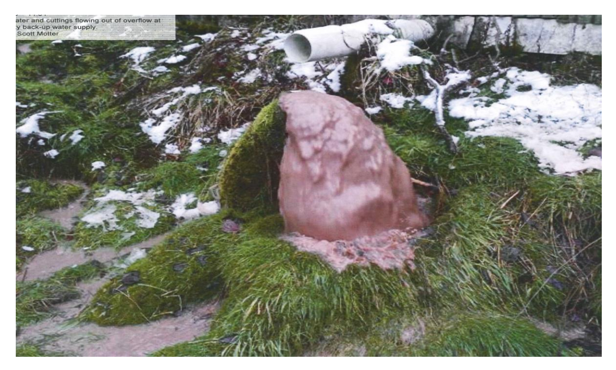
Waste bubbling into a municipal water supply from a drilling pit, Pennsylvania.

These trends have led Earthworks and its partners to call for a prohibition of open-air pits and impoundments and their mandated replacement with closed-loop tank systems.<sup>72</sup> Such systems would help prevent spills, contain volatile materials and wastes, and capture vapors; they can also be more efficient, eliminating the need for hundreds of truck trips to move waste away from well sites and enabling the transfer of contained waste directly to a processing facility.