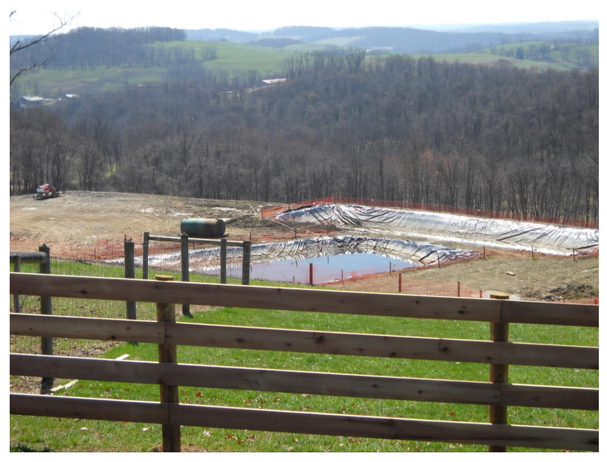
Production pits at a gas well site in Pennsylvania.

Production pits are often included in well permits, so operators do not have to submit information about their construction and use. Yet the land disturbance associated with these "accessory" structures can be significant, especially if there are several on one site. In reviews of permit applications in Pennsylvania, which sometimes include information on whether pits will be used in operations, Earthworks documented pits ranging in size from 100x100x12 feet with a capacity of 800,000 gallons to 220x120x14 feet with a capacity of 2.5 million gallons.