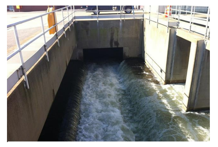
Wastewater discharge into the Ohio River near Pittsburgh.

However, PADEP has confirmed that this information is not included in the Environment