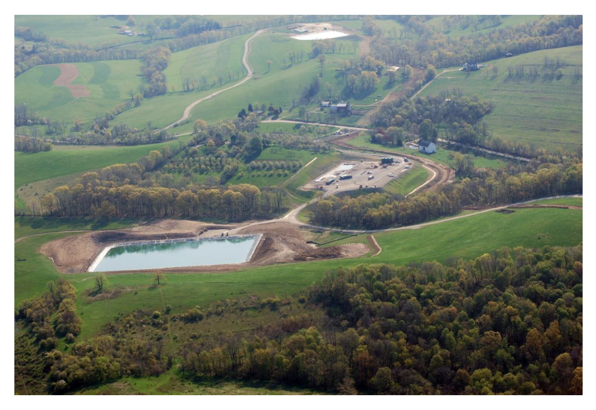
Centralized impoundments in Pennsylvania.

The capacity of impoundments varies with their size and depth, but some can store tens of millions of gallons of fluids. The largest impoundments are centralized waste storage facilities that service multiple well sites. Their use may also shift over time; for example, while initially permitted as a site-specific facility, Range Resources' Carter Impoundment in Washington County became the destination for contaminated waste from over 190 wells in a dozen townships.<sup>89</sup>