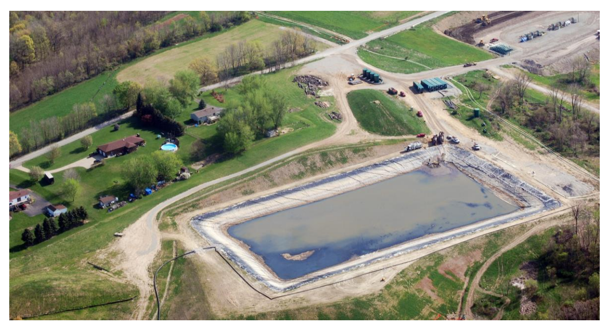
Centralized waste impoundment, Pennsylvania.

In summer 2014, the Chapter 78 revision process was delayed and became more complicated when the legislature passed a budget bill containing a requirement that PADEP distinguish between conventional wells and shale wells when issuing oil and gas regulations. PADEP later decided to issue two sets of regulations, one for conventional drillers focusing on the original Chapter 78 and a set explicitly for unconventional operators, now called Chapter 78a.<sup>349</sup> A final draft of both sets of rules will be issued for public comment in early 2015, with final rules expected by early 2016.