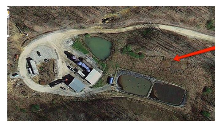
Lochgelly injection well and sediment pits in West Virginia, with seepage at the surface.

Both trends are particularly concerning because of a loophole in the Safe Drinking Water Act that allows the injection of oil and gas waste into UIC wells even if they are drilled directly into aquifers, as long as the aquifers are deemed to