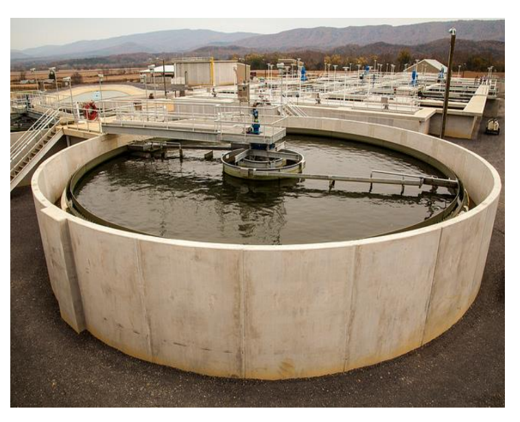
Wastewater treatment plant in West Virginia.

UIC facility operators are required to file a monthly "Report for Waste Disposal Wells" with WVDEP, which includes data on the volumes of waste injected each day, and maintain manifest records with information on the quantity, and transportation source, method of wastes delivered; however, this information is made available to WVDEP only if the agency requests it. 367 The permit application for a UIC facility in West Virginia requires information on the source, type, and physical and chemical characteristic of wastes destined for injection (which applicants include in a list of all the oil and gas wells that will be serviced by the particular facility).368