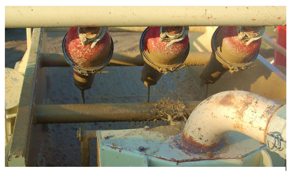
Shakers separating drilling muds and cuttings.

For example, a load of drilling sludge from southwestern Pennsylvania that was rejected by landfills in that state and in West Virginia was finally accepted by a specialized facility in Michigan, which needed to downblend it to get from the sludge's level of 570pCi/g of Ra-226 to the disposal facility's standard of under 50pCi/g.<sup>164</sup> In 2014, a company in Ohio applied for a permit to operate a disposal facility to store and process brine, drilling muds, drill cuttings, and tank bottom sediment, stating that operations would "involve 'blending' of waste material that exceeds the regulatory limit of 6.99 pCi/g Ra-226/228."<sup>165</sup>