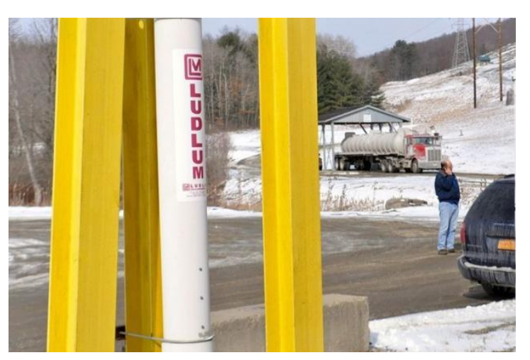
Radiation detector at a New York landfill.

report However, the also concluded that there are "potential radiological environmental impacts" if drilling fluids and filter cakes are spilled; such impacts "should be studied at all facilities in Pennsylvania that treat wastes to determine if any areas require remediation;" there is а "potential long-term disposal issue" with filter cake from treatment facilities; and some waste facilities may need to require the use of "protective equipment by workers or other controls."133