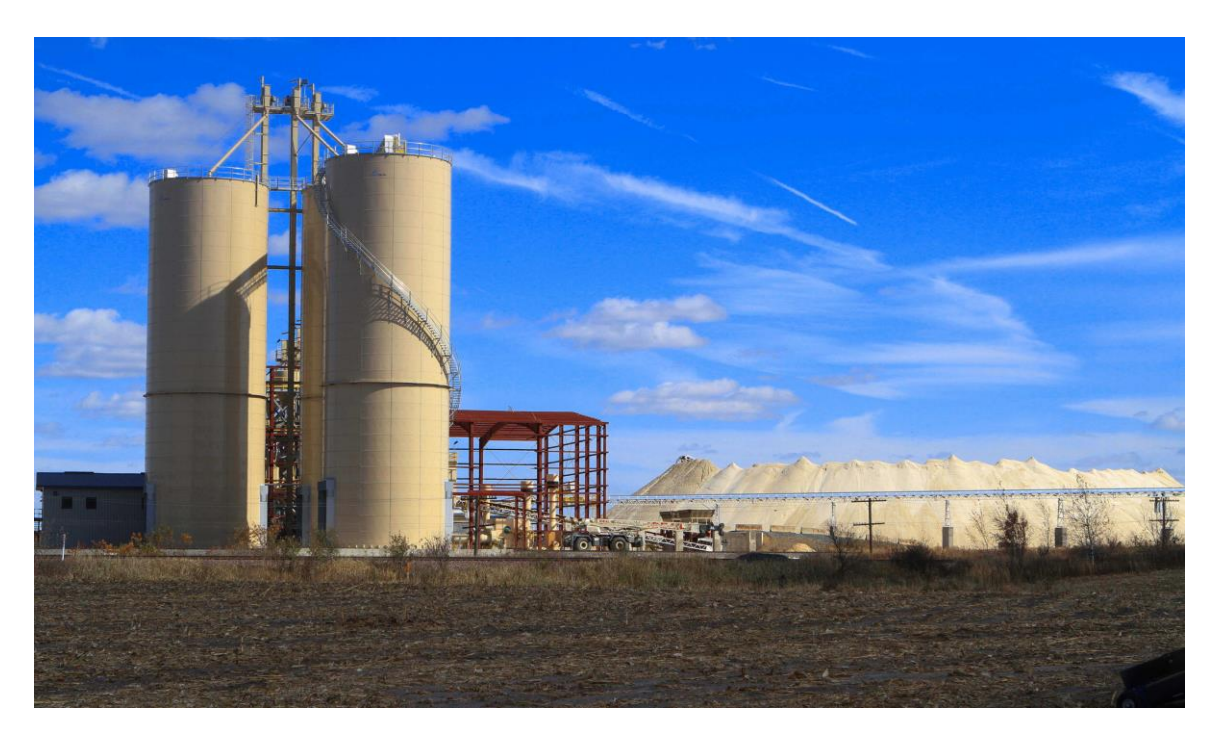
Fracturing sand mining on a Wisconsin farm.

To date, little information is available about the specific chemical constituents or concentrations in fracturing sand waste or its processing and disposal. Data from the Pennsylvania Department of Environmental Protection indicate that the amount of fracturing sand waste disposed of in the state grew more than 200% between 2011 and 2013, when it reached over 45,000 tons; most of this ended up in landfills.<sup>39</sup>