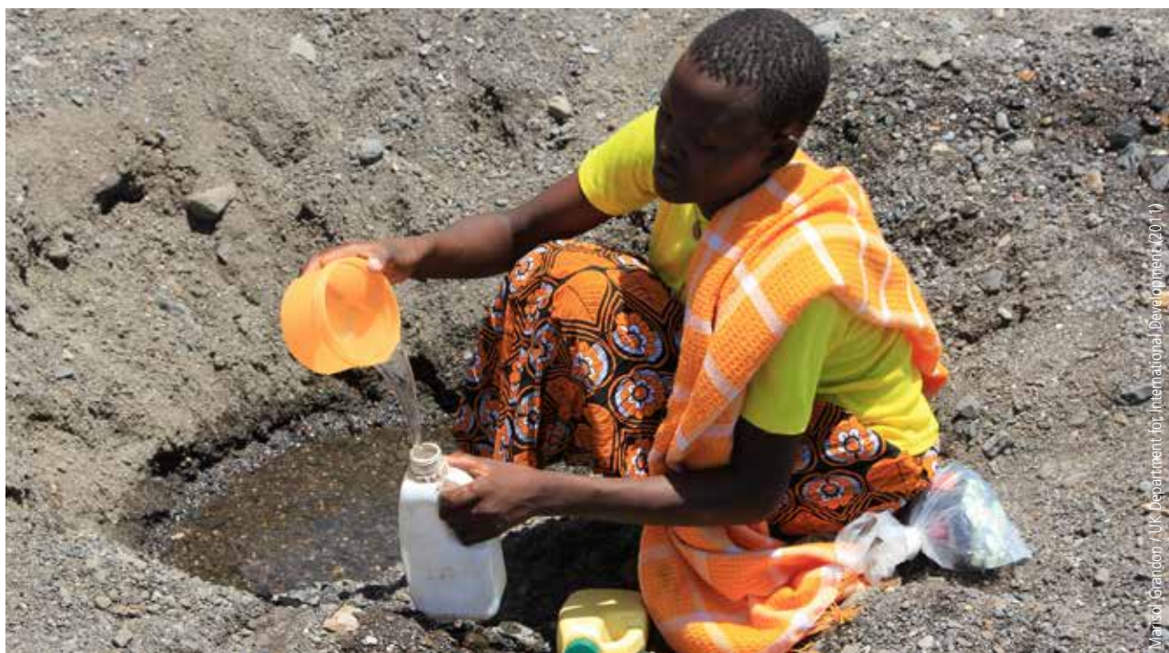
Climate change will reduce freshwater availability in arid regions that are already suffering from severe water shortages and drought, such as the remote Turkana region of Northern Kenya, where residents had to collect water from dry riverbeds during a period of prolonged drought.

Affected rights: right to water and sanitation, right to health, right to life, right to food, right to an adequate standard of living.