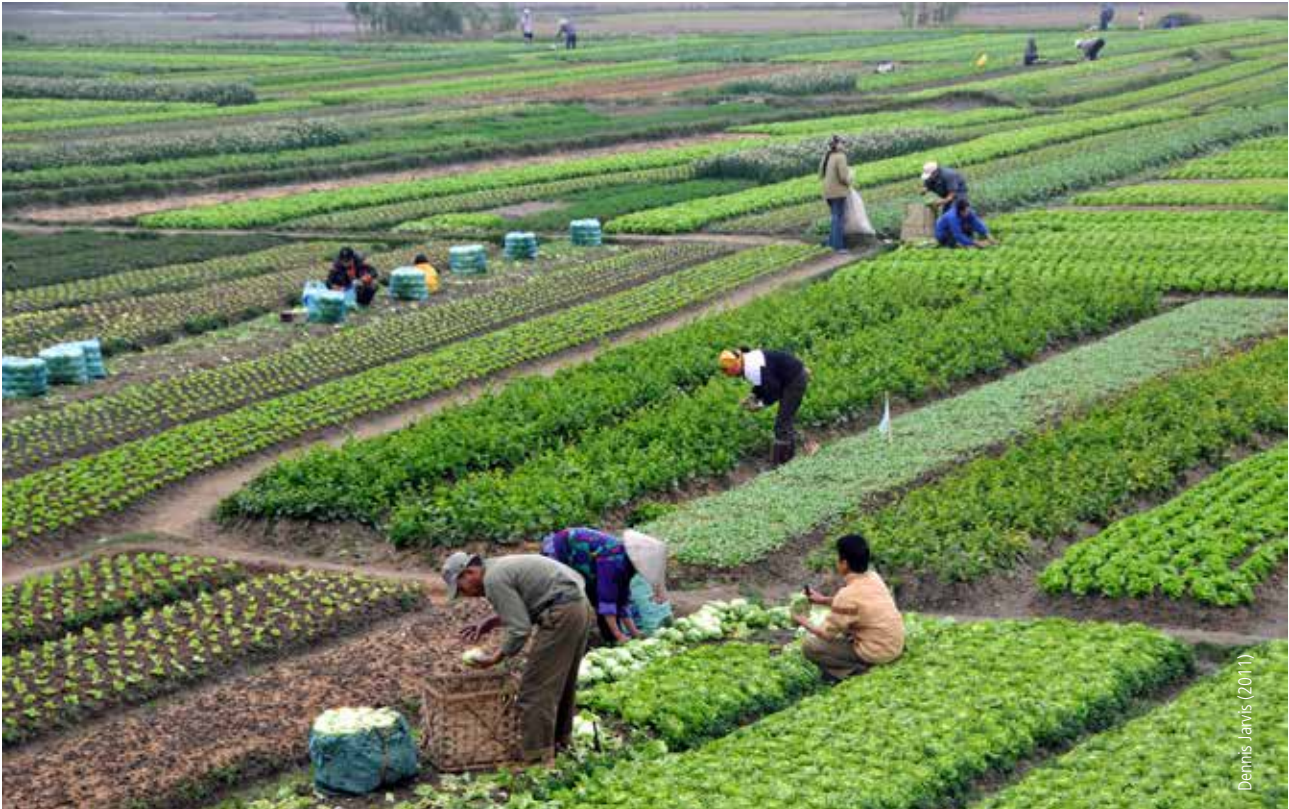
Changing precipitation patterns and higher temperatures can adversely affect food production in many parts of the world, such as Vietnam, where adaptation measures will be needed to protect food security and agricultural livelihoods.

extreme weather events, and the corresponding impacts on human health, water supply, ecosystems, natural resources, crops, and physical structures. Rural areas are also uniquely vulnerable to the effects of climate change due to: (i) a greater dependence on agriculture and natural resources, such as fisheries and forests; and (ii) existing vulnerabilities caused by poverty, lower levels of education, physical isolation, and neglect by policymakers. 33 Rural areas in developing countries face the most significant risks due to their geographical location (where climate change impacts are projected to be most severe), lack of adaptive capacity, and heavy reliance on agriculture and natural resources. 34