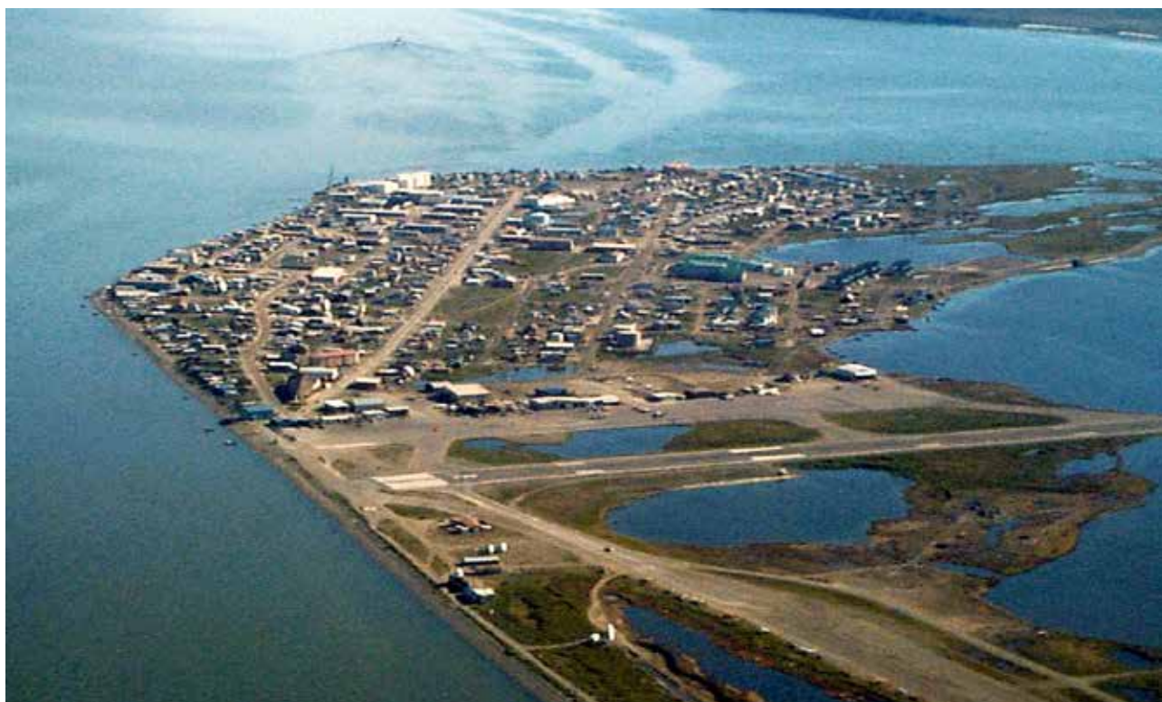
Aerial view of Kotzebue, Alaska, USA - an Inuit village facing the imminent prospect of displacement due to rising sea levels, melting permafrost, and erosion.

Affected rights: right to an adequate standard of living, right to health, right to life, right to food, right to water, right to property.